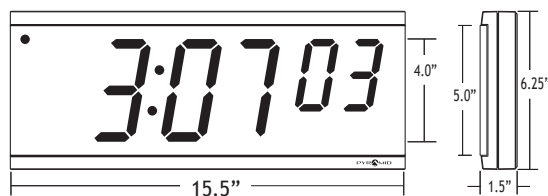
613576 4" x 6 Digit Series