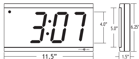
41357G 4" x 4 Digit Series